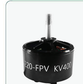
B4220 KV400 Dimension: \Phi 66 \times 50 mm Pulling force: 85/6769g