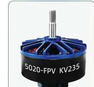
CF5020 KV235 Dimension: \Phi 58 \times 71.6 mm Pulling force: 125/9865g