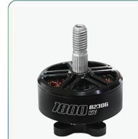
B2306 KV1800 Dimension: \Phi 30 \times 34.7 mm Pulling force: 65/912g