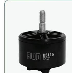
B3115 KV900 Dimension: \Phi 37.2 \times 48.3 mm Pulling force: 65/3630g