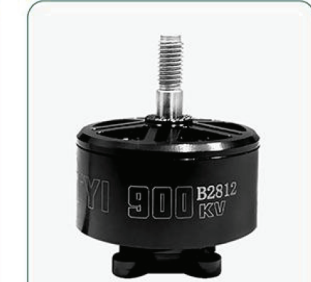
B2812 KV900 Dimension: \Phi 33.9 \times 41 mm Pulling force: 65/2737g