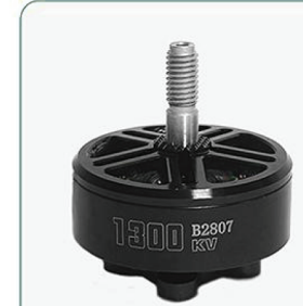
B2807 KV1300 Dimension: \Phi 33.9 \times 36 mm Pulling force: 65/2217g