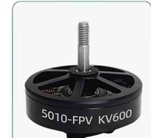
B5010 KV600 Dimension: \Phi 58.5 \times 52.2 mm Pulling force: 85/5589g