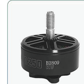
B2809 KV1250 Dimension: \Phi 33.9 \times 38 mm Pulling force: 65/2388g