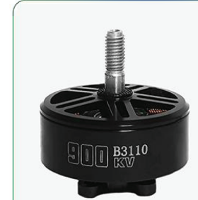
B3110 KV900 Dimension: \Phi 37.2 \times 38.3 mm Pulling force: 65/2900g