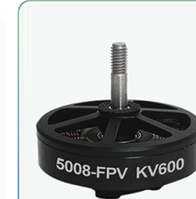
B5008 KV600 Dimension: \Phi 58.5 \times 50.8 mm Pulling force: 65/4100g