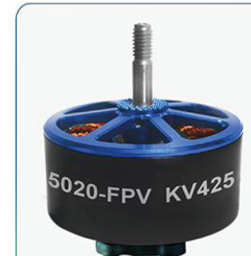
B5020 KV425 Dimension: \Phi 58 \times 62 mm Pulling force: 85/8437g