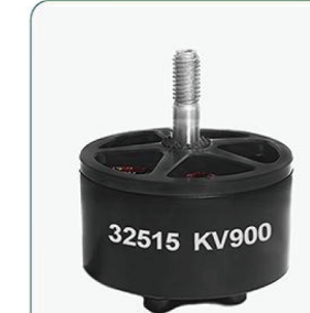
B32515 KV900 Dimension: \Phi 39 \times 48.3 mm Pulling force: 65/3621g