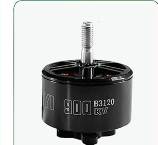
B3120 KV670 Dimension: \Phi 37.2 \times 53.8 mm Pulling force: 85/4795g