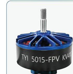
CF5015 KV410 Dimension: \Phi 58 \times 57.5 mm Pulling force: 85/7349g