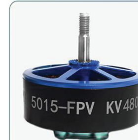
B5015 KV480 Dimension: \Phi 58 \times 57.5 mm Pulling force: 85/6837g