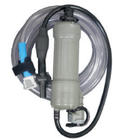
P248 Certified Post-Filter and Product Hose