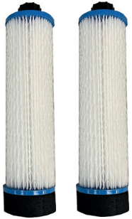
2x 1 Micron Prefilters