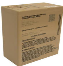
Bren-Tronics 2590 Battery (2 will fit in HFD Case)