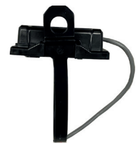
2590 Battery Connector