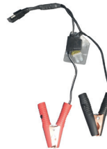
12V or 24V Connection