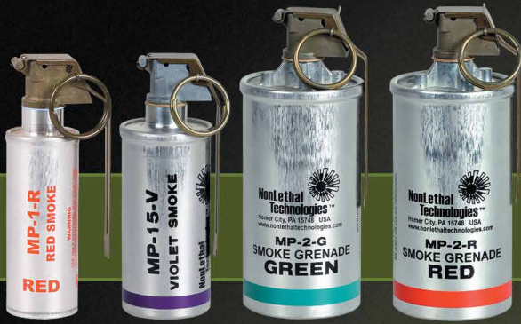
Law Enforcement Pyrotechnic

The MP-1, MP-15, and the MP-2 Series grenades are all available in Red, Green, Yellow, Orange, Blue, Violet, and White Smoke, and are an effective psychological tool when mixed with CS chemical deployment in crowd control operations