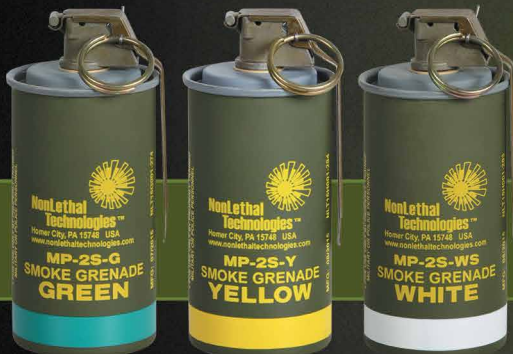
Military Type M18 Pyrotechnic

The MP-1, MP-15, and the MP-2 Series grenades are all available in Red, Green, Yellow, Orange, Blue, Violet, and White Smoke, and are an effective psychological tool when mixed with CS chemical deployment in crowd control operations