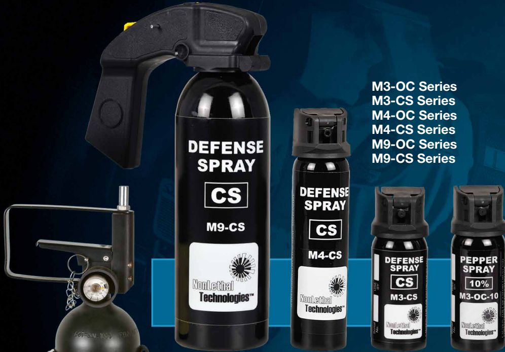
Aerosol Defense Spray

M3-OC Series M3-CS Series M4-OC Series M4-CS Series M9-OC Series M9-CS Series