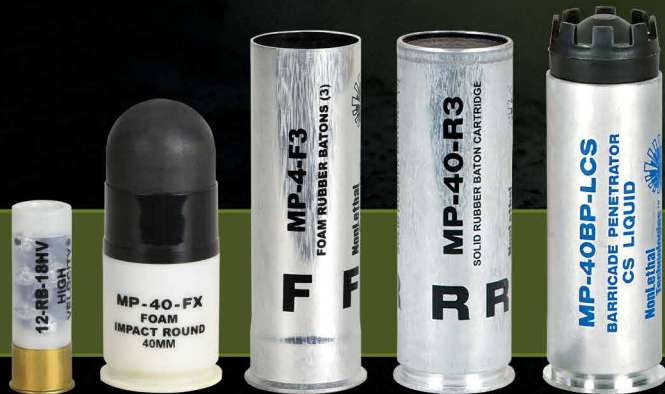
12 gauge, 38mm and 40mm Impact Munitions