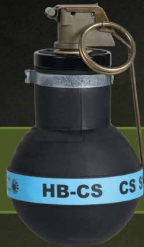
Hand Ball Pyrotechnic Grenade

NonLethal Technologies manufactures a full range of chemical irritant grenades, both in pyrotechnic and blast-powder configurations, to fit your crowd control or tactical requirements - whether outdoor or indoor.