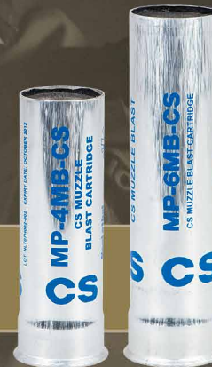
Muzzle Blast Cartridges

Muzzle blast cartridges are best used in close quarter missions either on the street or indoors at correctional facilities deploying a dense cloud of irritant dust.