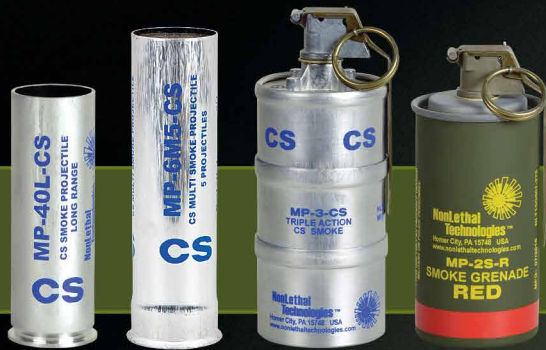
38mm and 40mm Projectiles and Grenades with CS, OC, Colored Smoke, TPA White Smoke, or HC

Developed for Field Deployment and Training in Less Lethal Force Options...for the Military, Corrections, and Law Enforcement.