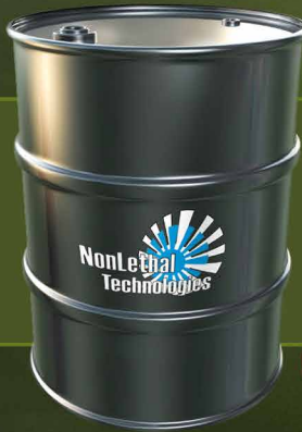
Bulk Chemical Irritants in Liquid, Powder, or Pelletized Pyrotechnic Forms