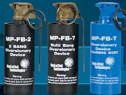
Flash Bang Grenade

The best support device in tactical entry operations to stun and disorient the targets. Standard configurations in single, two, and seven Flash/Bangs. Other configurations available on special order. An extremely effective design for the entry team.