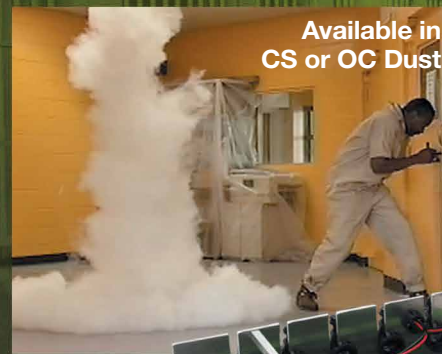
Available in CS or OC Dust

Systems consist of the Control Unit, Single and Multiple Dispenser Housings, and the Tear Gas Dispensers. Systems can be retrofitted into existing facilities or designed into the initial planning of new facilities. Contact NLT sales for more details on system design and hardware costs.