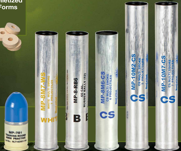
Hi-Load™ and Special Munitions