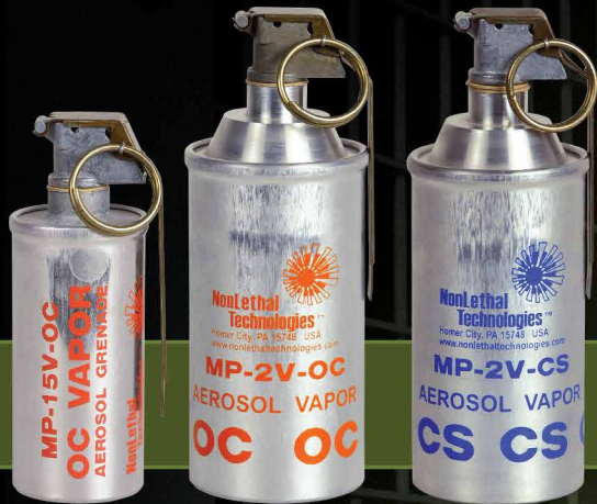
Aerosol Vapor Grenade

NonLethal Technologies manufactures a variety of indoor use grenades ideal and effective for indoor barricade situations and for prison and correctional facility use.