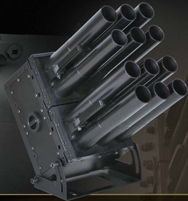
IronFist™ mounted on a Control Solutions CS5200 Ring Turret

NonLethal Technologies' basic 12 barrel Vertical Weapon Pod, provides the vehicle systems integrator the ability to fit one or two on a simple roof turret, an open ring turret or a remote weapon station, delivering to the fire control officer a valuable escalation of force capability. When the threat is one of civil unrest, the IronFist™ can be loaded with any of the NonLethal Technologies' conventional less lethal 37/38-40mm rounds, or our Hi-Load™ 37/38-40mm rounds to rapidly deploy a blanket of less lethal munitions into, or over, a hostile crowd. If deployed as a 40mm system, the platform can deploy any of our standard 40mm less lethal and flashbang rounds, our 40mm white smoke rounds for screening, or even the 40x46 flare illumination rounds in night time tactical operations.