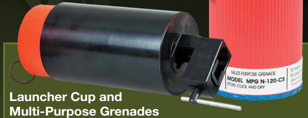
Launcher Cup and Multi-Purpose Grenades

MP-15V-CS Aerosol Vapor Grenade MP-15V-OC Aerosol Vapor Grenade MP-2V-CS Aerosol Vapor Grenade MP-2V-OC Aerosol Vapor Grenade