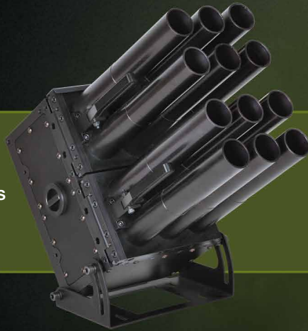
38mm and 40mm Weapons Systems 6, 12, 24 and 36 Barrel Configurations Variety of Mounting Options Available