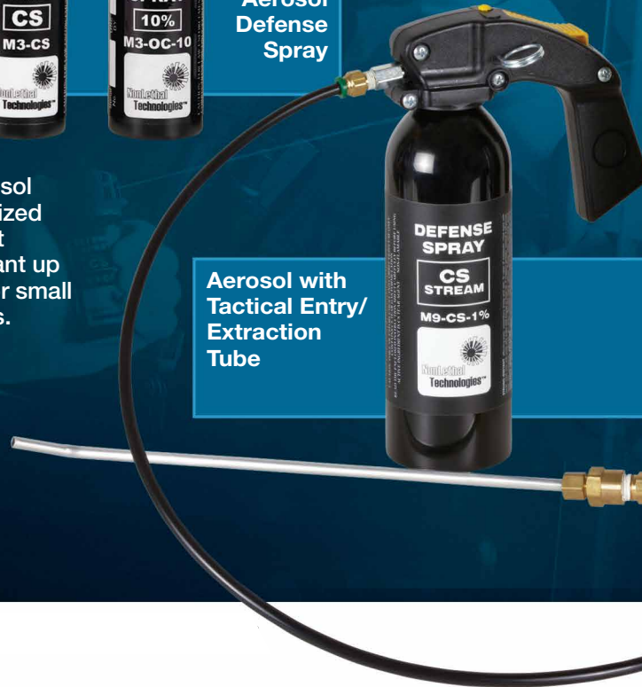
Aerosol with Tactical Entry/Extraction Tube