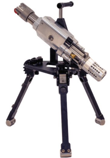
29mm Neutrex Disrupter on Stand