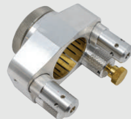
20mm Dual Laser Pointer