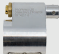
20mm Single Laser Pointer