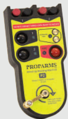
P2 Blasting Machine