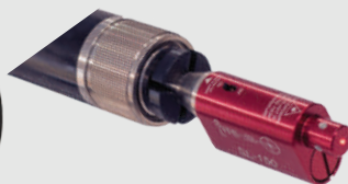
Bore Sight Laser