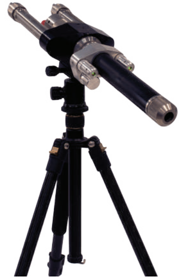
20mm RC MKIII Disrupter on Tripod